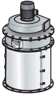
A, Flanged body-type filter with fan