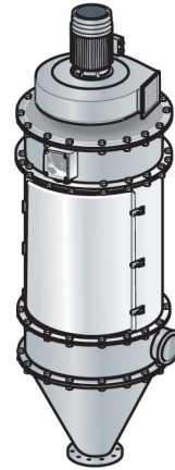
S6, with cone and fan