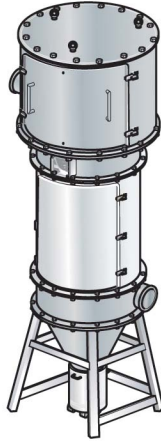
S1, with acoustic hood and dust bucket